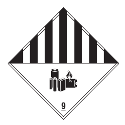
Lithium Battery Class 9 Hazard Label

NOTE : No text other than the Class "9" must be included in the bottom part of the Lithium Battery Class 9 label. IATA 7.2.2.4