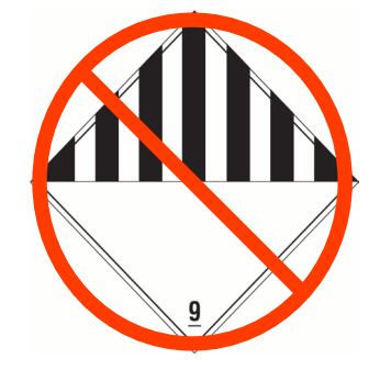
Class 9 Miscellaneous Dangerous Goods Hazard Label

The Class 9 label cannot be used as the hazard label for Section I/IA/IB shipments effective 01/01/19.