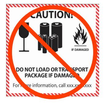
Lithium Battery Label

The Lithium Battery Class 9 hazard label must be used instead.