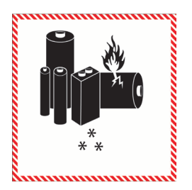
Lithium Battery Mark