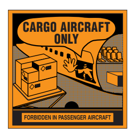
Cargo Aircraft Only Label