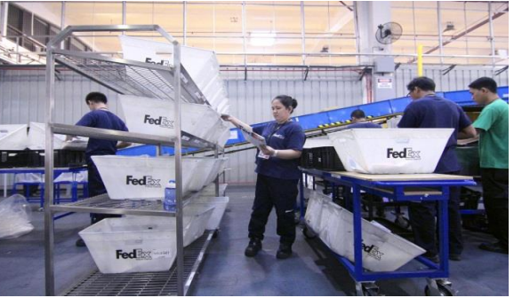
price, currency, and country of origin (COO).

• The invoice should include the quantity, weight, unit