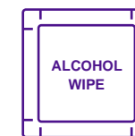
Alcohol wipe / swab