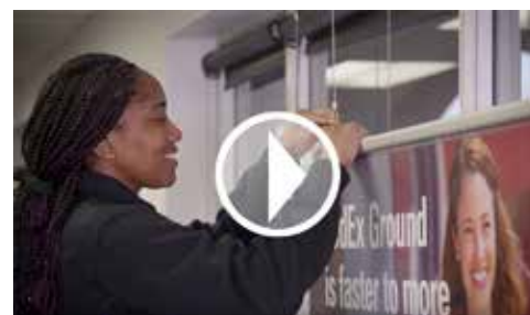
See how FedEx Office distributed print works in action.