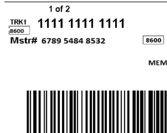
Detail of shipping label showing 12-digit tracking number.

When drivers arrive to pick up freight, they can now scan both 1D and 2D barcodes on the shipping label. This gives customers immediate access to their 12-digit tracking numbers, improves visibility and tracking, and reduces manual data entry errors.