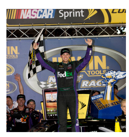
Denny Hamlin won the historic night race at Bristol during a five-win season in 2012.

Hamlin recorded three poles in 2012 – including at historic Indianapolis Motor Speedway – and his final win of the season at New Hampshire was the 100th Cup Series victory for Joe Gibbs Racing.