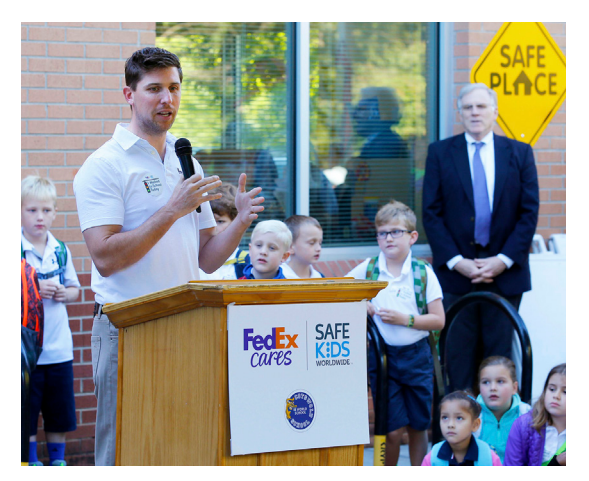
Hamlin led more than 200 students to class on National Walk to School Day to demonstrate the importance of pedestrian safety.

donated $100,810 to Safe Kids in the program's inaugural year. Hamlin and the entire FedEx Racing crew also supported Safe Kids during National Walk to School Day on October 4, and they led more than 200 students to class at Cotswold Elementary School in Charlotte, N.C., while teaching them the importance of pedestrian safety in the process.