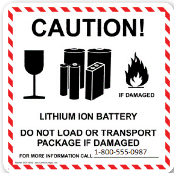
Lithium Battery Handling Label