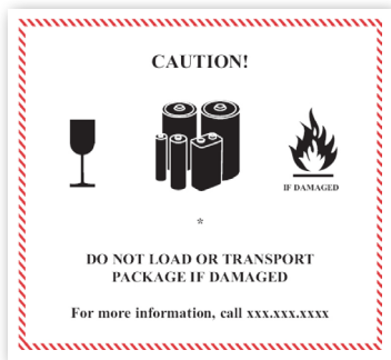
Lithium Battery Handling Label

All Cells and Batteries must pass UN Safety Tests