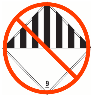
Class 9 Miscellaneous Dangerous Goods Hazard Label

The Class 9 label cannot be used as the hazard label for Section I/IA/IB shipments effective 01/01/19.