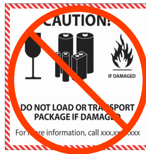
Lithium Battery Label

The Lithium Battery Class 9 hazard label must be used instead.