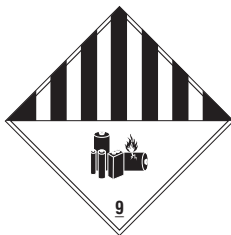
Lithium Battery Class 9 Hazard Label

NOTE: No text other than the Class "9" must be included in the bottom part of the Lithium Battery Class 9 label. IATA 7.2.2.4