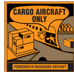
Cargo Aircraft Only Label