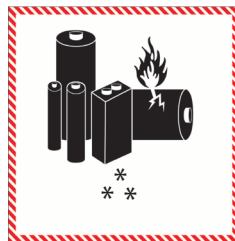
Lithium Battery Mark