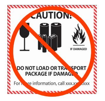
Lithium Battery Label

The Lithium Battery Class 9 hazard label must be used instead.