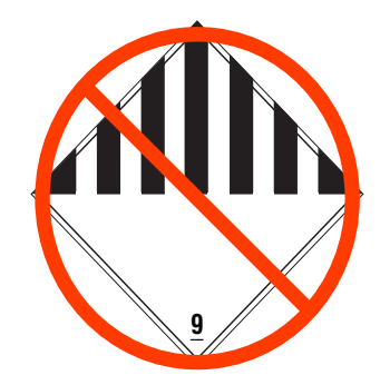
Class 9 Miscellaneous Dangerous Goods Hazard Label

The Class 9 label cannot be used as the hazard label for Section I/IA/IB shipments effective 01/01/19.