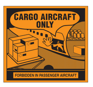
Cargo Aircraft Only Label