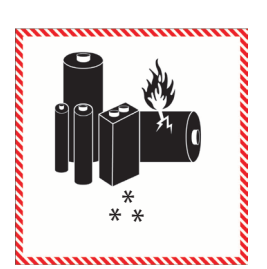
Lithium Battery Mark