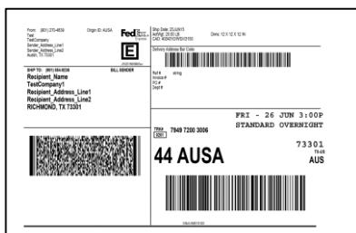
FedEx Old Plain Paper Label